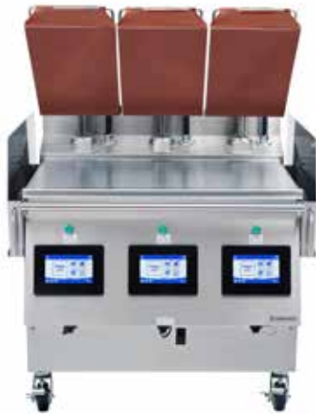
Model XPG36 Shown with flared grease cans