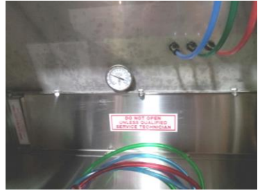
Chemical flow indicator