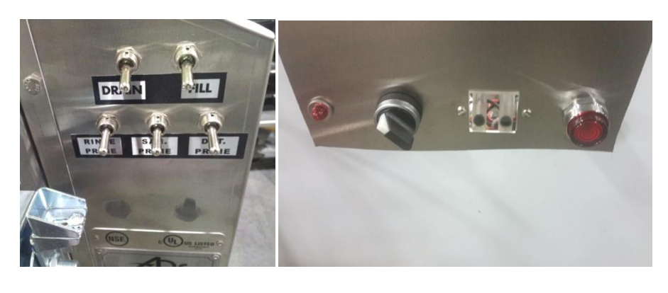
Fill, Drain, Fill, Prime

If empty chemical containers are changed out for full containers, use the momentary primer switches to re-prime the lines. The primer switches are located on the side of the control box in the lower access door. Switches are labeled for each chemical pump. When chemical starts to enter the sump thru the colored tubing, release the prime switch. The chemical flow indicator will show movement of the dark beads when chemical is pumping; this is the required visual indicator. After the spray arm is installed in the spray base and the pump filter has been cleaned and replaced in the sump, prepare for the first cycle by turning on the Master Switch, located on the side of the lower access door.