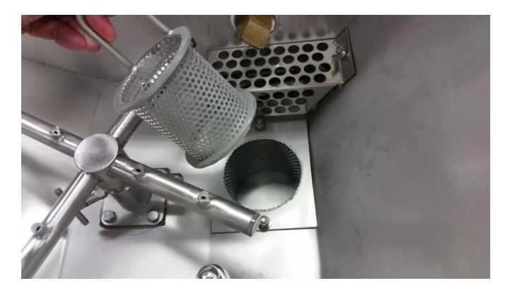
Pump filter (085-6218), Placement of the pump filter into the drain sump