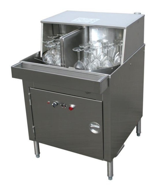
Model: ASQ II Glass Washer, Gravity Drain