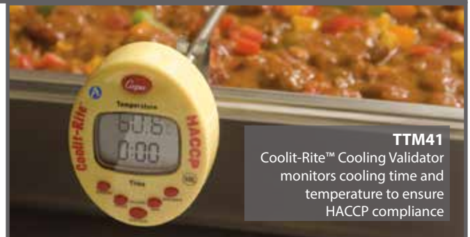
TTM41 Coolit-Rite™ Cooling Validator monitors cooling time and temperature to ensure HACCP compliance