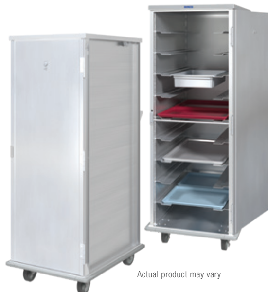
Actual product may vary

Aluminum Tray Meal Delivery Carts offer great flexibility for patient meal delivery and soiled tray pick up. The solid, welded construction means a long life in your operation. Transport and deliver food trays with convenience and ease!