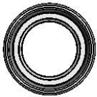
007861-45 B-0107 Sprayhead Ring Qty. = 1