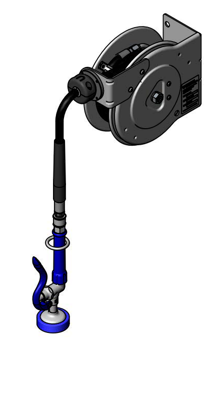
Features & Benefits: