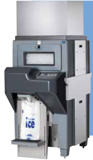
Ice Pro DB650