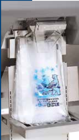
Bags are blown open

Fill 6 to 8 bags per minute. That's 85% faster than manually bagging.