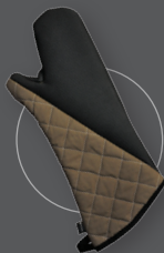
BestGrip® Oven Mitt