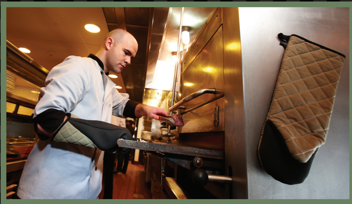
San Jamar's BestGrip® oven mitts provide superior heat protection and easy storage with built-in magnet.