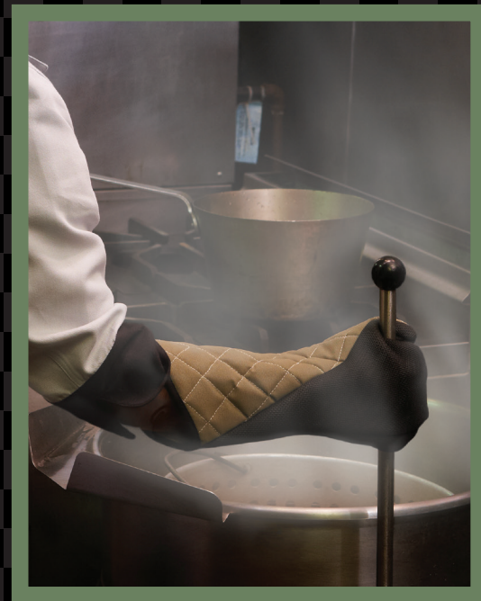
BestGrip® oven mitts also protect against steam.