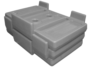
Multiple Buffet Camchillers can stack when freezing or storing.