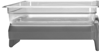
Buffet Camchiller with 2½" pan.