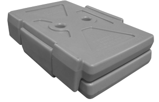
Two Buffet Camchillers can interlock for freezing or storing.