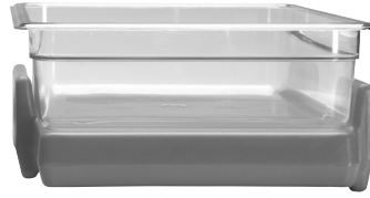
Buffet Camchiller® with 4" pan.