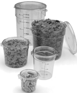
ROUND STORAGE CONTAINERS