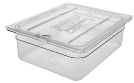
CLEAR FOOD PANS AND LIDS