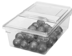
FOOD STORAGE BOX WITH SLIDINGLID™