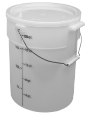
PAIL WITH BAIL