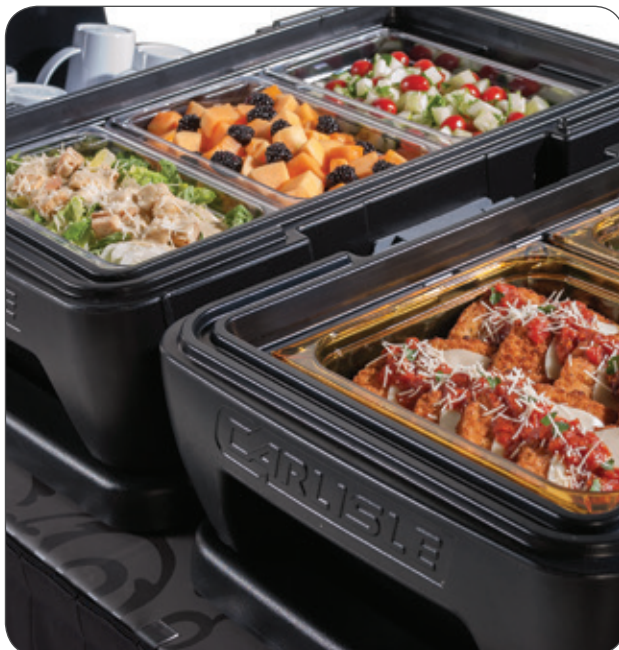
Sleek, contemporary design is perfect for elegant buffets and outdoor parties.

NSF Listed products are designated with a Δ