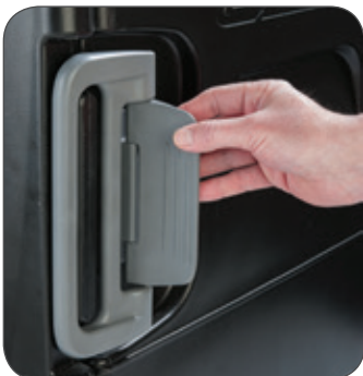
Button-hole latch design offers convenient one hand operation.

The only transport line to offer you beauty and durability in one product. Their sleek, contemporary design is perfect for elegant buffets and outdoor parties. Sturdy construction means they are durable enough to handle daily transports. Only Cateraide ITs have a special coating to give them a beautiful glossy sheen. This makes them even more attractive on your buffet table and the special coating makes them easy to clean. Cateraide ITs are available in Onyx, Caramel or Olive.