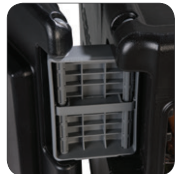
Exclusive double hinge opens 270°.