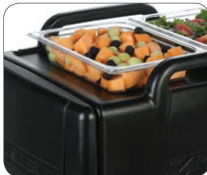
Flat top design can be used as a prep surface when space is limited.