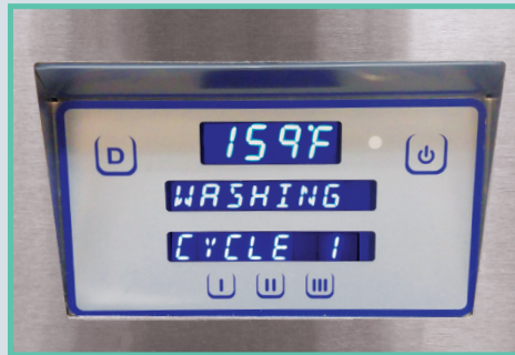
Digital LED Control Panel