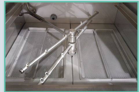
Interchangeable Scrap Baskets