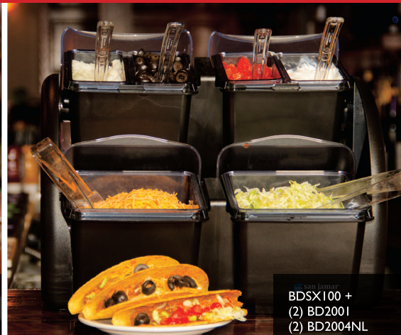
BDSX100 + (2) BD2001 (2) BD2004NL