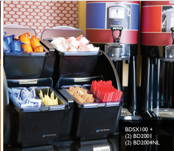
BDSX100 + (2) BD2001 (2) BD2004NL

BAR RAILS SALAD STATIONS BEVERAGE CENTERS CONDIMENT COUNTERS COFFEE AREAS