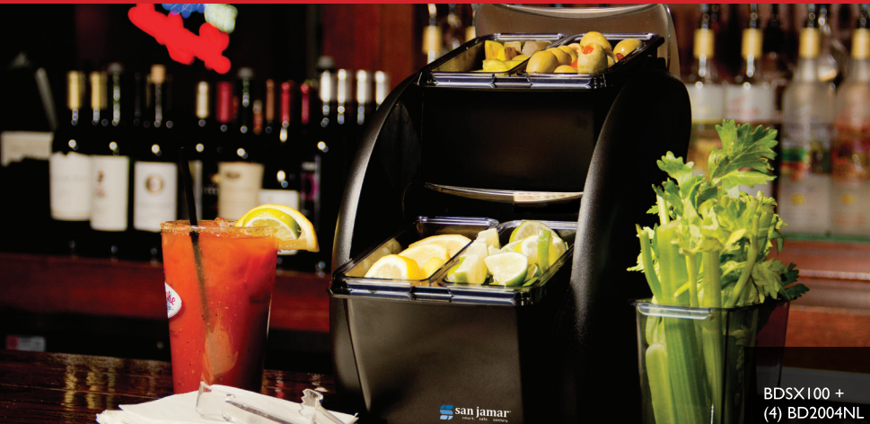
BDSX100 + (4) BD2004NL