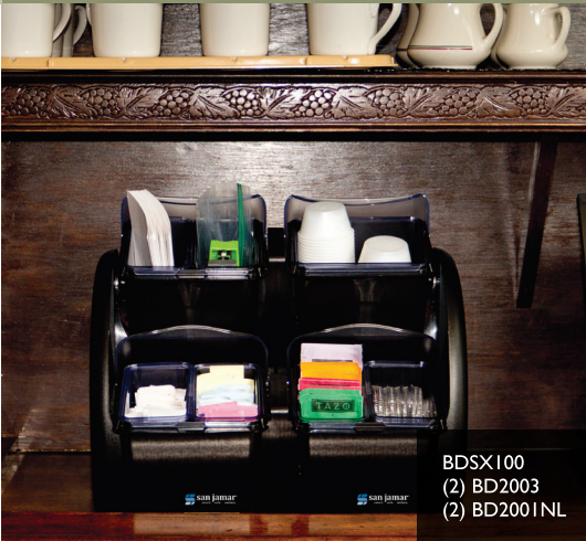
BDSX100 (2) BD2003 (2) BD2001NL