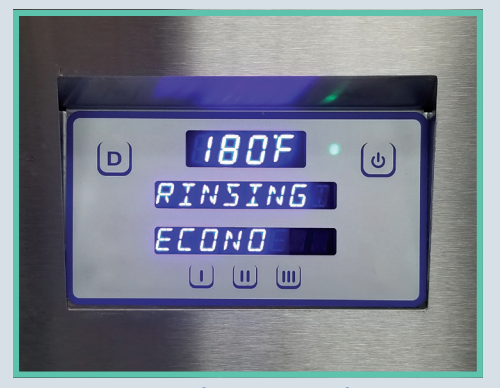
Digital LED Display