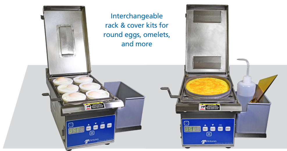
Interchangeable rack & cover kits for round eggs, omelets, and more

With a 120V / 15A power cord, the lightweight ESM is ready to plug in anywhere.