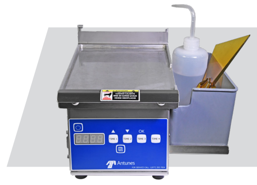
Small footprint base grill station

How do you free up grill space, improve menu consistency, and shorten cook times for your eggs, omelets, and scrambles? Do it with the versatile Egg Station Mini — combining the speed and precision of countertop egg cookers with a small size and changeable racks designed for expanding menus and streamlined kitchens.