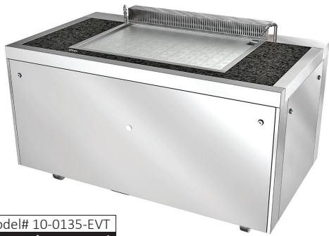
Model# 10-0135-EVT INDOOR/OUTDOOR* ELECTRIC 40AMP 24" x 35" Griddle

The EVent® 35E & 48E include a high-efficiency electric griddle integrated with a ventilation system that pulls air across the griddle surface through a series of filters including an electrostatic precipitator that removes smoke and grease particulates before exhausting clean air. Additionally, The EVent is equipped with the latest in technology and safety and includes a Buckeye Model BFR-5, Kitchen Mister Automatic Fire Suppression System for commercial cooking applications.