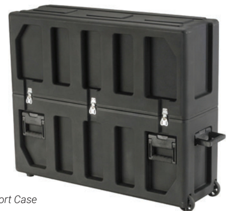
Storage & Transport Case Included