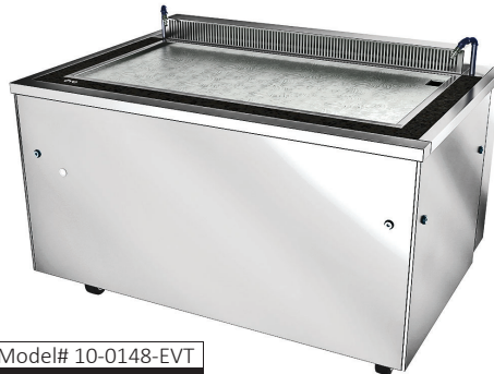
Model# 10-0148-EVT INDOOR ELECTRIC 40AMP 24" x 48" Griddle