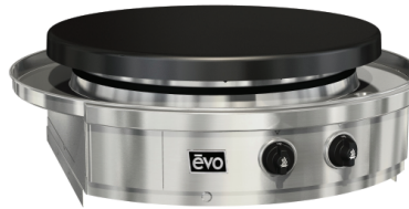
Model# 10-0070 INDOOR GAS: NG or LP