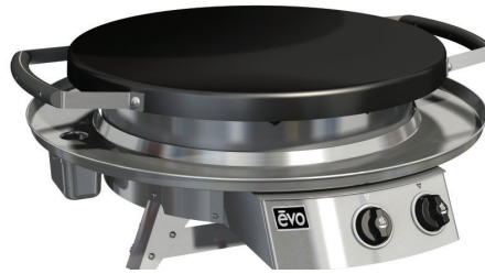
Model# 10-0020 OUTDOOR GAS: NG or LP