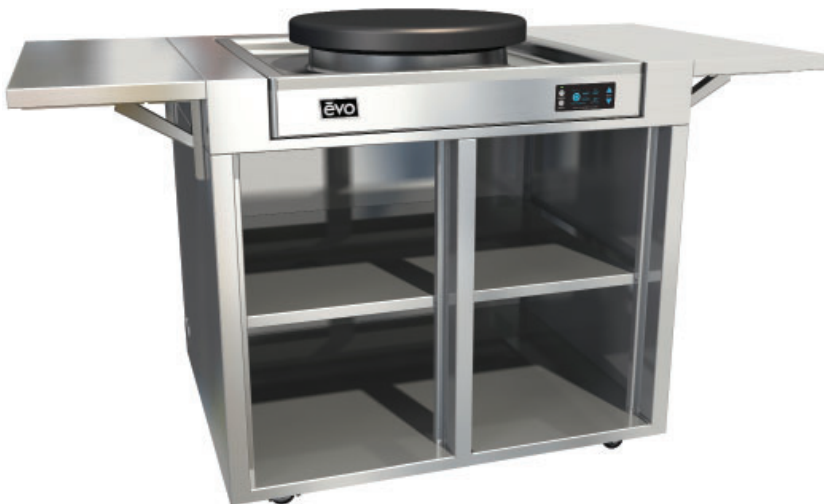
Service Cart Available 10-0037-CSC