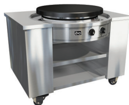
Model# 10-0070-DCS INDOOR GAS: NG or LP