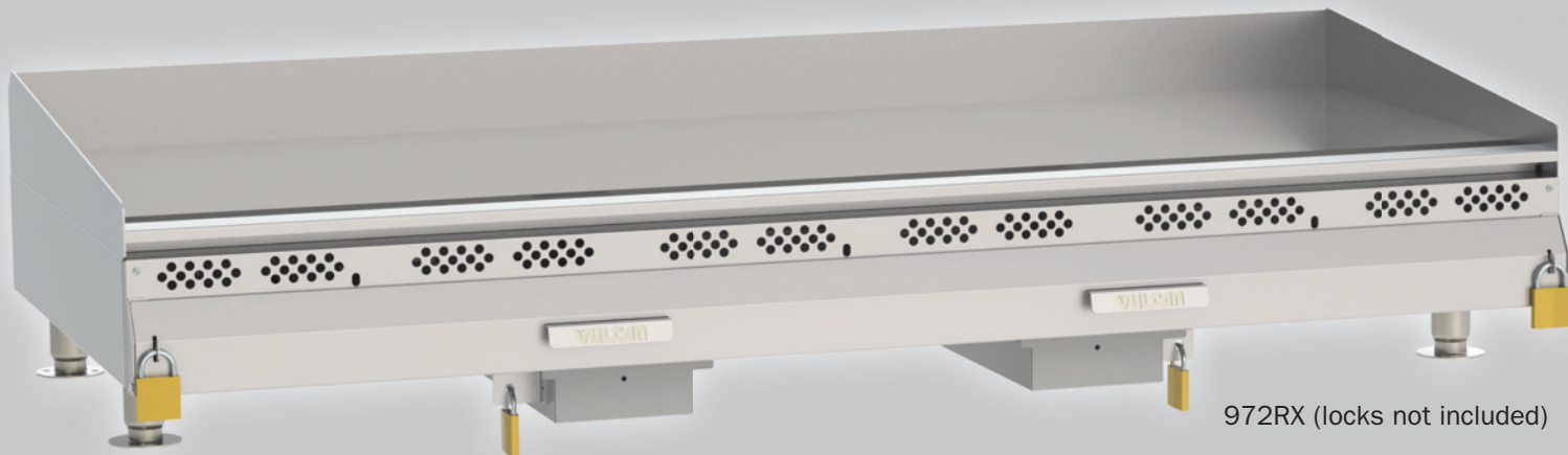
972RX (locks not included)

Whether you choose gas or electric, our griddles are designed and built to stand up to the abuse and harsh conditions you face every day.