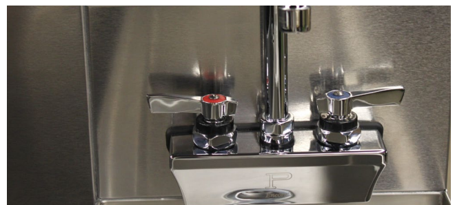
16. Stand back and admire your fine work. Well done!