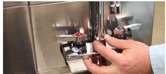
15. Secure the goose neck spout by turning the threaded retention collar clockwise until snug. Finish tightening with an adjustable wrench or channel locks. Do not overtighten.