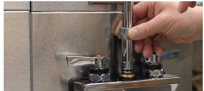
14. Insert the bottom of the spout (goose neck spout shown) into center opening of faucet body.