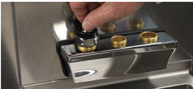
11. Insert hot water valve assembly in the left opening in the faucet body. Note: Hot and cold valves are identified with "Hot" or "Cold" stamped in valve body. Turn chrome nut on top of valve to tighten. Note: Torque spec is 25 ft. lbs.