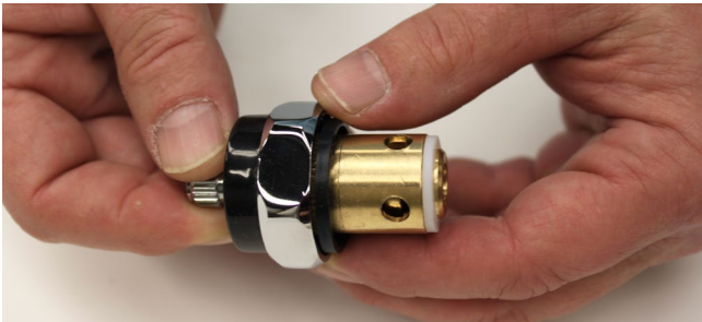
10. Faucet valve assembly. Turn handle stem to close the valve before installing. Attach handle to stem if needed to close valve.