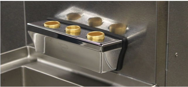
9. Completed faucet cover installation. When seated correctly, the valve body threads protrude through cover as shown.