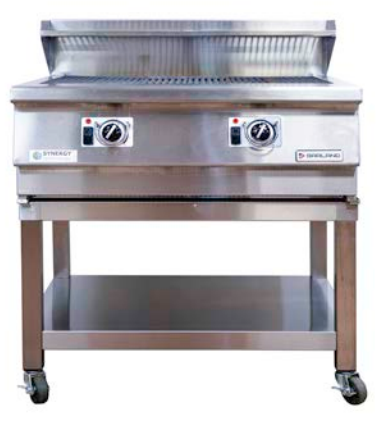
Shown with optional slow cook shelf

Install it directly on the counter, on a Garland stand or a refrigeration base.