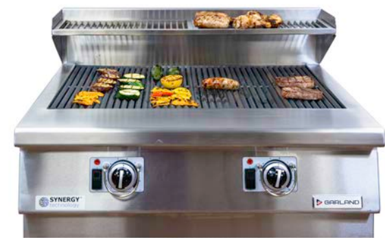
Shown with optional slow cook shelf

XHP Broiler reduces the amount of grease that passes through the ventilation system, so they require less cleaning.