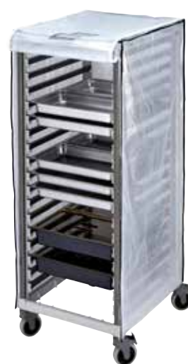
GBCTUGNPR21 Optional Heavy Duty Vinyl Cover for GN 2/1 Full Size Trolley.