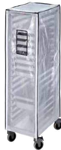
GBCTUGNPR11 Optional Heavy Duty Vinyl Cover for GN 1/1 Full Size Trolley.

All Trolleys ship knockdown (KD) complete in 1 box with casters and bottom frame wedges factory assembled on posts.