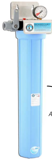
HDI-12 30,000 gal 3 GPM

Available with 5-micron sediment pre-filter