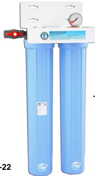
HDI-22P 60,000 gal 6 GPM

Available with 5-micron sediment pre-filter