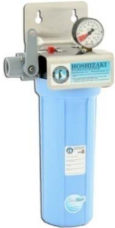
HDI-11 15,000 gal 1.5 GPM