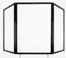
SINGLE PANEL & FOLDING COUNTER TOP