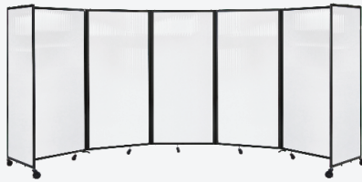
ROOM DIVIDER 360

Our Social Stations give you the flexibility to create division of space quickly and easily with little storage space. A privacy solution any social space can customize and use!