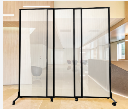
SOCIAL STATION SLIDING