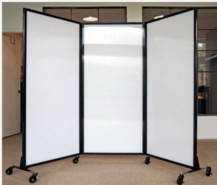
SOCIAL STATION FOLDING