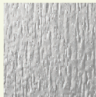
E1 Embossed 1 16 Gauge Stainless Steel