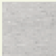
BRS Brushed Stainless Steel

ALL HOT VESSELS CAN BE MIXED AND MATCHED AND INCORPORATED INTO STOCK AND CUSTOM HOT FOOD TEMPLATES. ALL PRODUCTS WILL ACCOMMODATE TEMPERATURE UP TO 450 DEGREES. KEEPS HOT FOOD HOTTER.