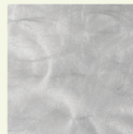
RSS Random Swirl Stainless Steel