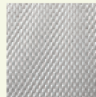
E3 Embossed 3 16 Gauge Stainless Steel