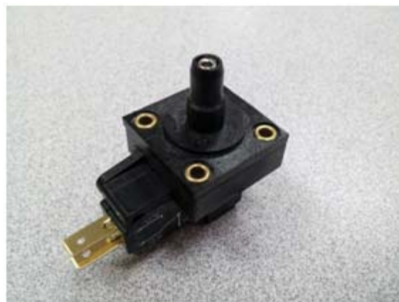
Optional chemical alarm pressure switch