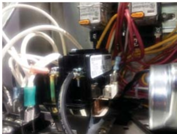
Wash motor contactor to the left of the cam timer motor