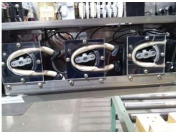
Showing deter, rinse, sanitizer internal chemical pumps

ADS provides three (3) peristaltic pumps to dispense liquid chemicals