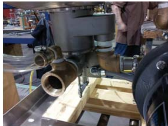
Drain outlet, 1.5" pipe