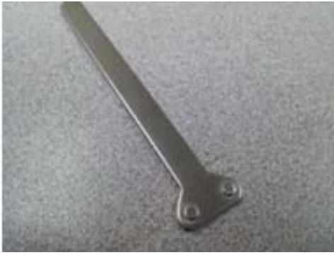
Cam timer adjustment tool