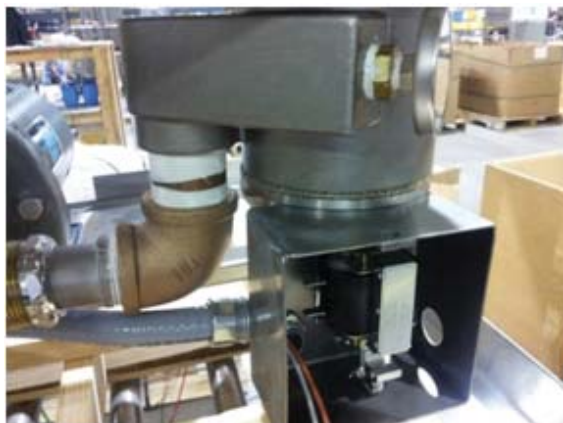
Showing drain solenoid