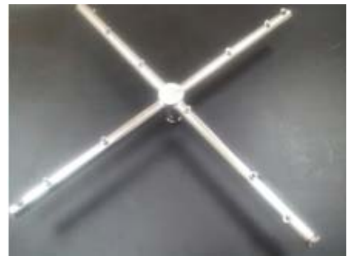
Cross arm for light glassware (081-6212)