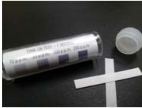
Chlorine test strips