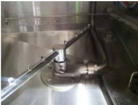
Spray arm, base w/thumb screws