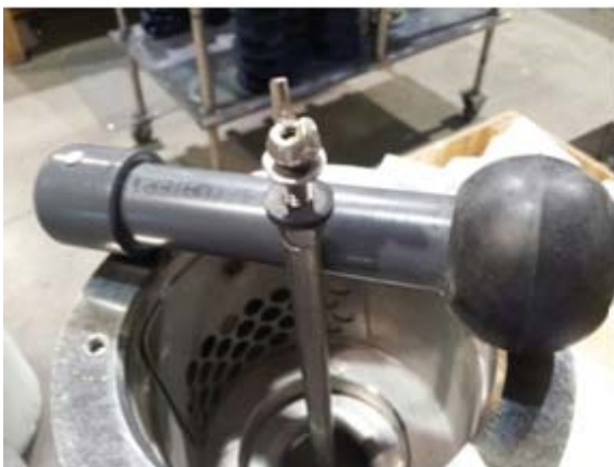
ET (gravity) drain ball, note rubber washer on push rod