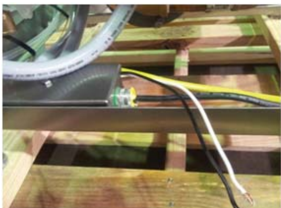
Power junction box for incoming 120v power