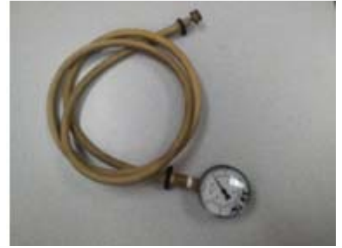
Spray arm pressure tester #088-1048

To widen the notch (length = time energized) or close the notch use the timer adjustment tool, which is provided and taped to the control box shelf. This tool has two raised buttons that fit into the holes on the side of each wheel. The factory sets the start of each function using the right-side wheel of the cam. TO ADJUST rotate only the left-side cam wheel. The left-side of the wheel controls the point when that specific functions ends. Factory settings are only initial settings, adjustments will be required for each chemical and the water fill time because water pressures will be different for every account.