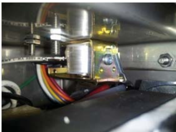
Optional buzzer for low level chemical alarm