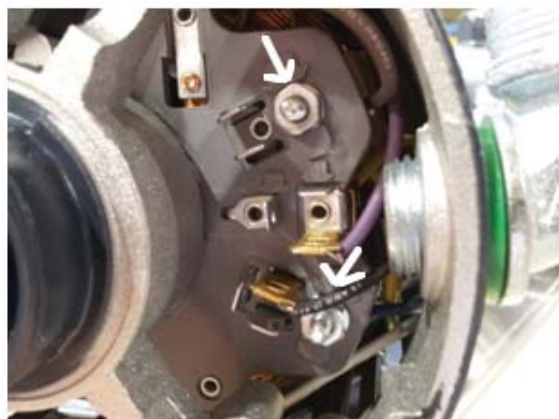
1.5 HP Motor, arrow 1 arrow 2 point to L1 and Neutral connect points

IT IS RECOMMENDED THAT THIS EQUIPMENT BE INSTALLED USING A NEW CIRCUIT BREAKER.