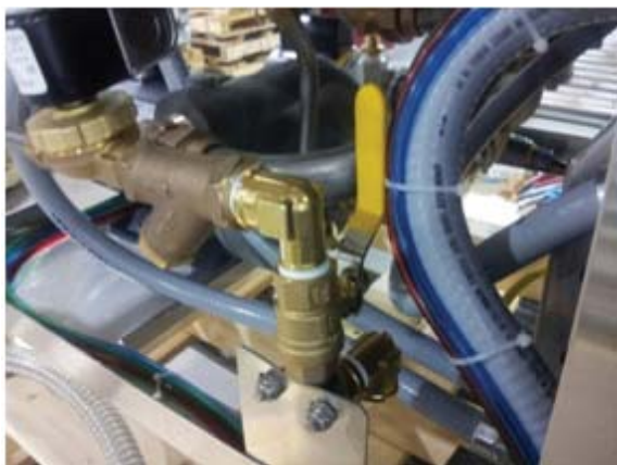
Showing ½" female pipe inlet, ball valve, y-line filter, H2O solenoid

#3 DRAIN SIZE —The gravity drain model uses 1.5" female pipe to exit the sump.