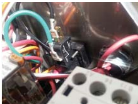
Optional Chemical Alarm switch