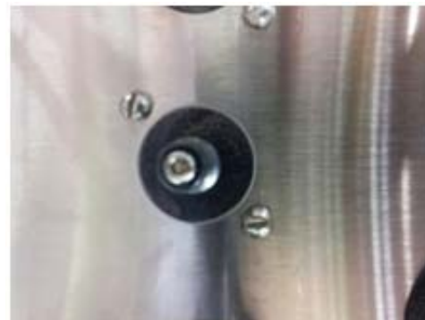
Chemical alarm barb adjusting screw *