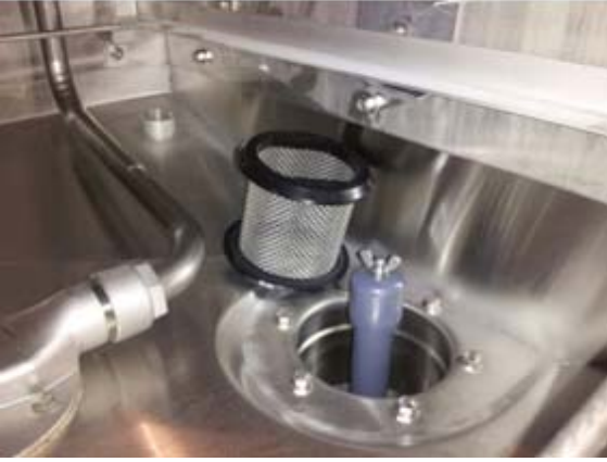
Drain ball assembly and pump filter