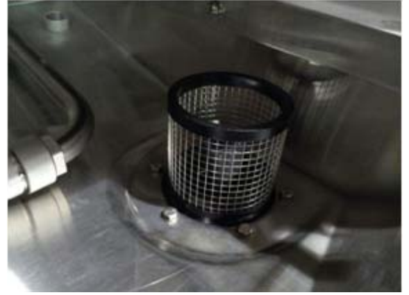
Optional ET (Gravity) secondary filter #085-6616

8 PUMP FILTER—Inspect the sump area and verify pump filter is in place. It should be removed and emptied only after the machine is completely drained. Verify that chemical feed lines are in their proper container and that lines are primed. Post an operational wall chart close to the machine.