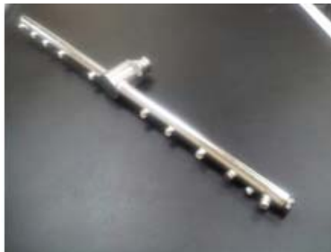
Standard ET-AF spray arm (081-6208)