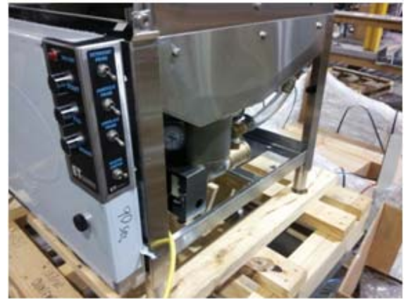
Showing controls on lower door

The power supply for 120 volts, 20amps, shall consist of two #10-12-gauge wires and one suitable green ground wire. The 20 amp breaker or 20 amp fuse must be on a clean circuit for only this machine. ADS has provided a junction box with a 7/8" hole for the 1/2" conduit that will bring the building's electrical power to the machine. This junction box is attached to the lower frame of the machine, below the control box when the door is closed.