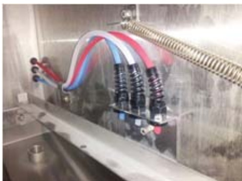
Showing chemical lines above sump

Inspect the transfer tubing for any cuts or holes, keep them protected and secured out of the way