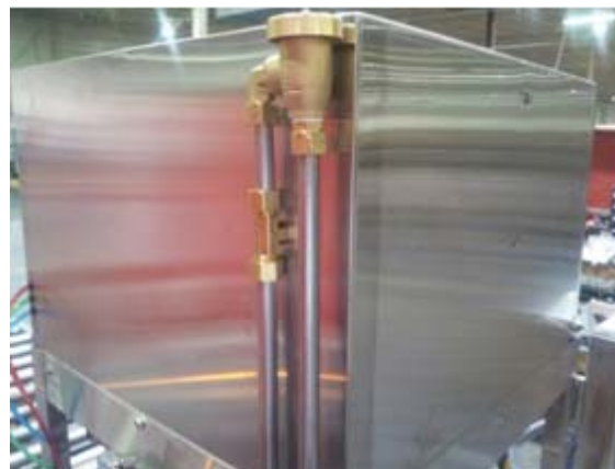
ASSE approved vacuum breaker (backflow preventer)