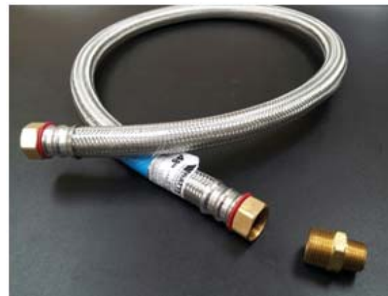
OPTIONAL 48" hot water inlet flex hose and adapter (088-1068)