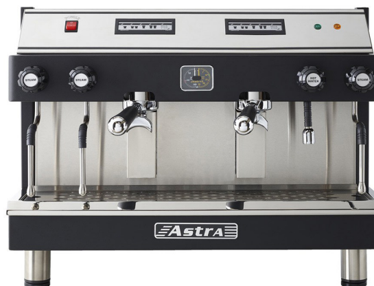
MEGA II Automatic M2012

Creating the perfect blend of artistry and consistency, Astra's automatic range provides portion control with the touch of a button. Designed for high output with the addition of a self-tamping, high-density group head, nickel plated copper boiler and a temperature stabilizing thermocycling system.