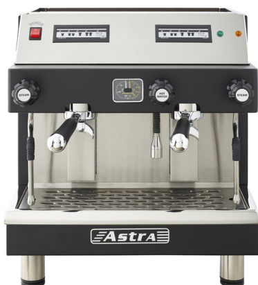
MEGA II Compact Automatic M2C014