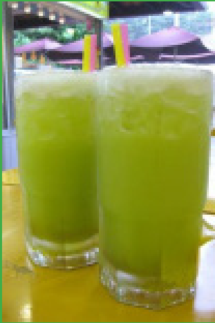
Serve Over Ice