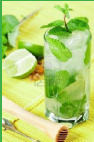
Mix for Mojitos