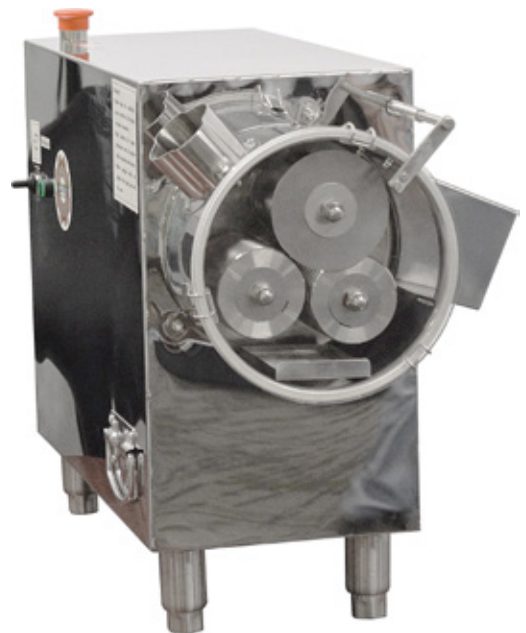
Optional Stainless Steel Cart Available