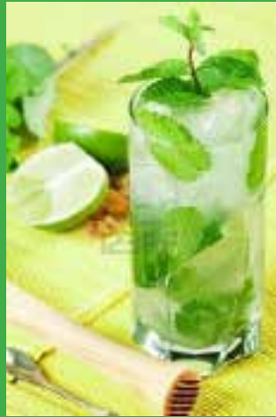
Mix for Mojitos