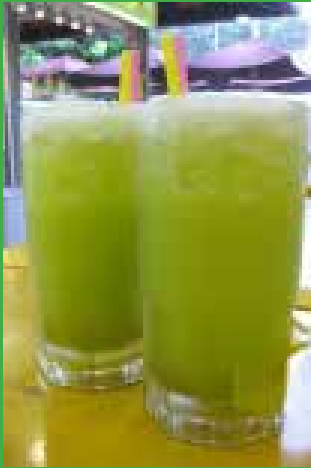
Serve Over Ice