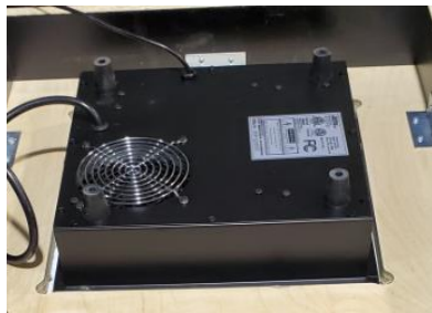
Figure 1. Induction Range Placed in Cutout