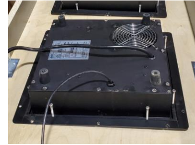
Figure 2. Induction Range & Mounting Bracket with Leveling Screws