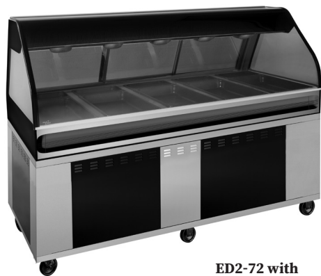
ED2-72 with BU2 Short Base Front view shown with optional casters