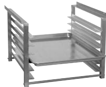
TA-44 Pan Rack Slides