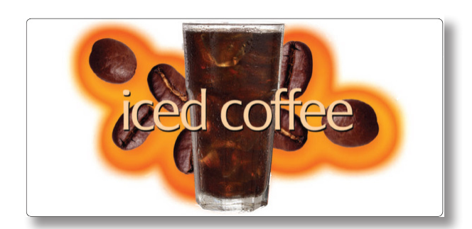
Optional Iced Coffee Label: WC-38472