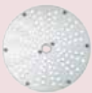
PNC 650148 Model P300 Parmesan disc