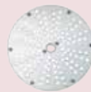
PNC 650149 Model K300 Knödel disc