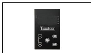
Provides accuracy & reliability