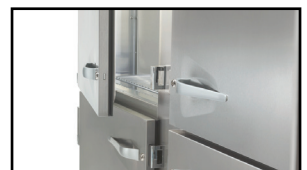
Cam-lift hinges & workflow handles