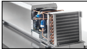
Easy to service top-mount modular system