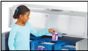
Ensures the smallest students can reach what they need