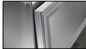
Sliding door protects gaskets