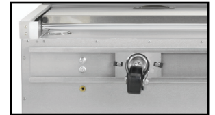
Enables durability & flexible positioning