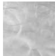
Random Swirl Pattern

TO ORDER: CWAL6 TCP ITEM NUMBER COLOR CODE CWAL6 TCP