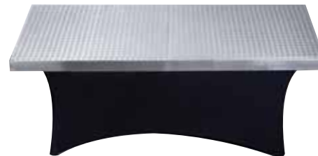
Tablecloth not available.

Shown with Circle Swirl finish Ships in two pieces