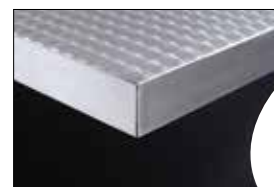
Reinforced welded corners.

CW22235 CSS ITEM NUMBER FINISH CW22235 CSS