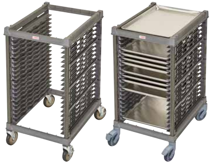
Metal Caster UPR1826H20