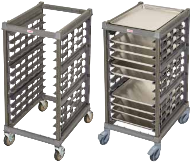
Metal Caster UPR1826H12