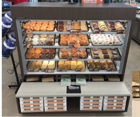
Optional package ledge shown above