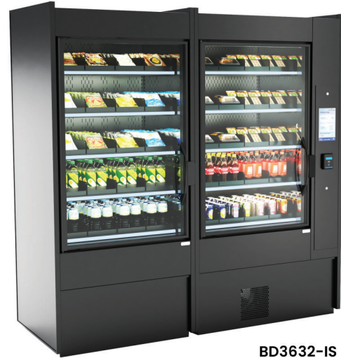
BD3632-IS ARM DUO