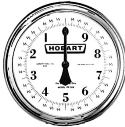
30# x 1 oz. Maximum Capacity 30 lb. Device No. PR309-1 and PR309-3