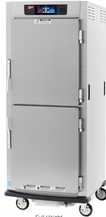
Full Height Dutch Solid Doors