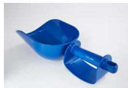
Sanitary ice scoop included

Bin & Accessories: 3-Year Parts & Labor Carts: 2-Year Parts & Labor