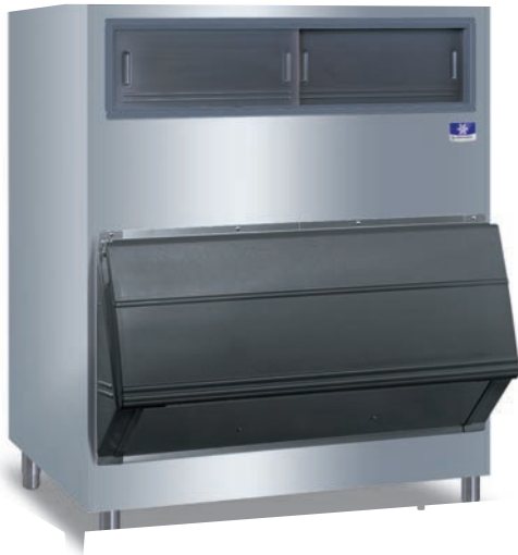
F-1300 Ice Storage Bin