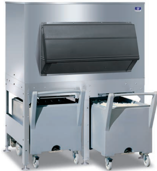
FC-1350 Ice Storage Bin & Cart System