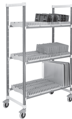
Vertical Drying and Storage Rack