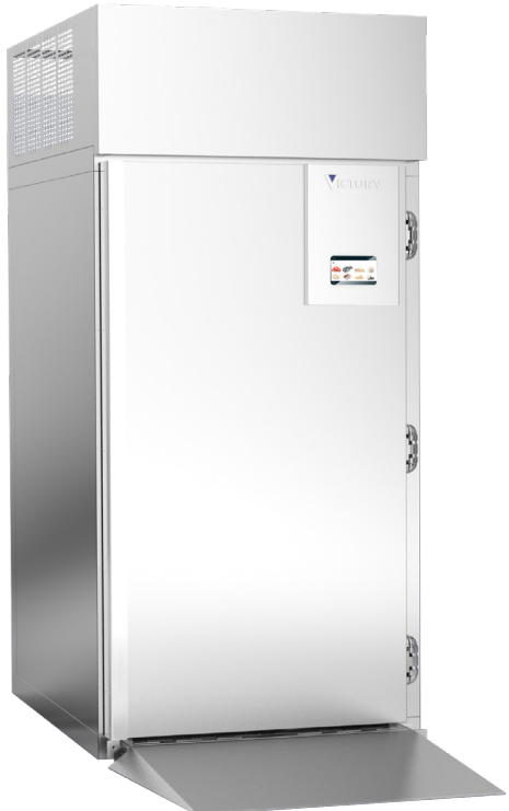
Note: Shown With Optional Ramp