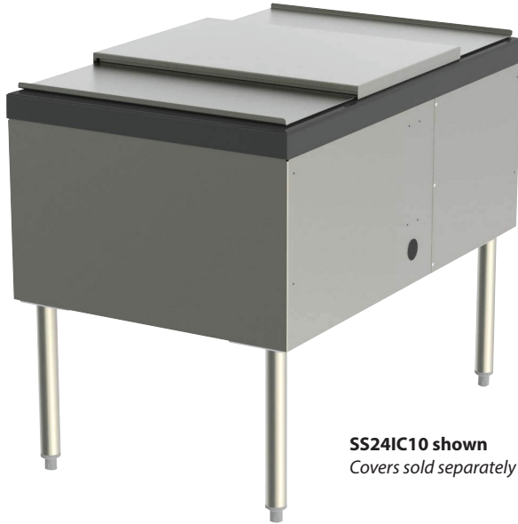
SS24IC10 shown Covers sold separately