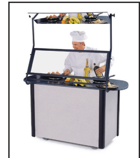
Optional food shield and demo mirror

Measurements in ( ) denote metric millimeters, unless otherwise specified. OA height with food shield is 57 1/2" (1461); OA height with demo mirror is 78 3/4" (2000).