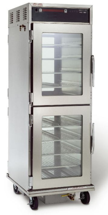
HHC 980 SmartHold full-size heated holding cabinet with automatic humidity control

Henny Penny SmartHold humidified holding cabinets create and maintain ideal conditions for holding a wide variety of hot foods over extended periods of time prior to serving.