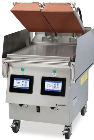
Model XPG24 Shown with straight grease cans