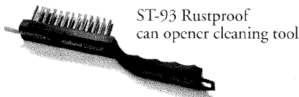
ST-93 Rustproof can opener cleaning tool

Note: G-2 Series standard length bar is 16" (40.6 cm) long. Extra long bar is 22" (55.9 cm) long.