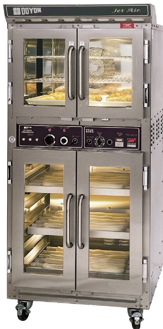
Jet Air Oven/Proofer Combination, Electric, Capacity (3) 18"x26" Pans, Steam Injection, Reversing Fan System, Digital Temperature Control and Timer, (9) Pan Proofer with Auto Water Fill, Glass Doors, Stainless Steel Construction, Casters, cETLus, NSF